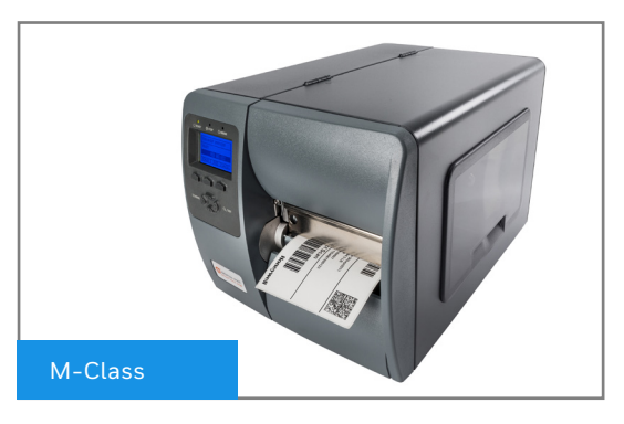
- Back to Industrial Printers