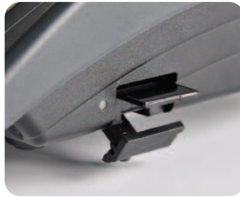
Electronic journal – convenience and savings