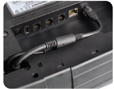
Functional communication ports, including Ethernet and USB