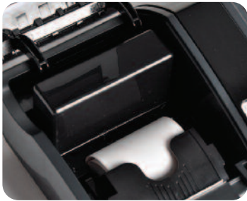
"Easy load" printing mechanism — easy replacement of paper