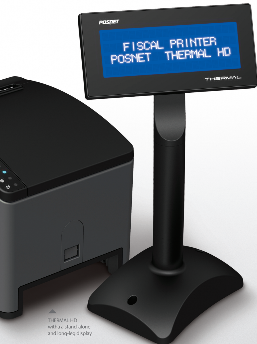
THERMAL HD with a stand-alone and long-leg display

Printers use coils with the paper length of 100 m and two possible values of paper width: 80 mm or 57 mm. They can work in three operation modes: ■ 56 characters /80 mm ■ 40 characters/80 mm and ■ 40 characters /57mm. Hence, users are able to benefit from advantages offered by the device in efficient and complete manner.