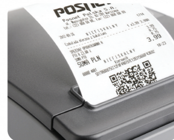
Printing a receipt