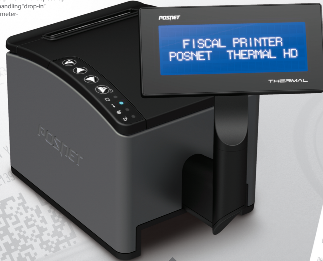
THERMAL HD with an integrated display

Application of a sturdy, heavy-duty printing mechanism with an incorporated cutter makes it possible to print with the speed up to 47 lines/s (150 mm/s), and the easy-handling “drop-in” system enables replacement of 100-meter-long paper coils in only few seconds.