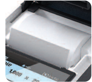
Easy replacement of paper "drop in & print"