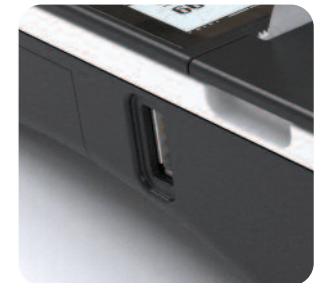
Data archiving on a USB flash disk, USB scanner and drawer handling