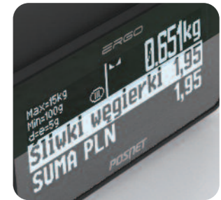
Graphic handling and customer's displays

The function of programming the reminders allows the user to decide what should the cash register remember about. At the time indicated, the device will print and display a message and remind about an important matter, e.g. the need to execute a monthly report, the date of tax payment or the manager's birthday.