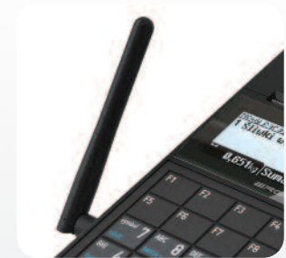
Additional wireless communication interfaces