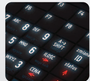
Backlit, spill-resistant keyboard