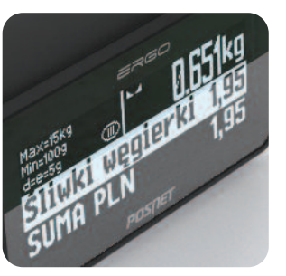
Graphic handling and customer's displays

The function of programming the reminders allows the user to decide what should the cash register remember about. At the time indicated, the device will print and display a message and remind about an important matter, e.g. the need to execute a monthly report, the date of tax payment or the manager's birthday.