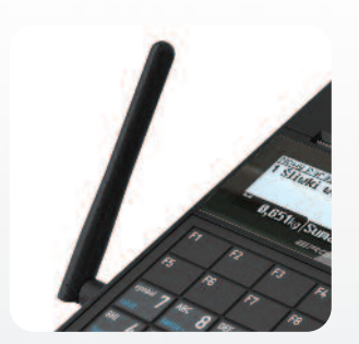
Additional wireless communication interfaces