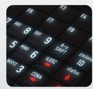
Backlit, spill-resistant keyboard