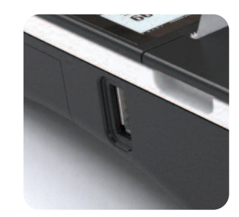
Data archiving on a USB flash disk, USB scanner and drawer handling