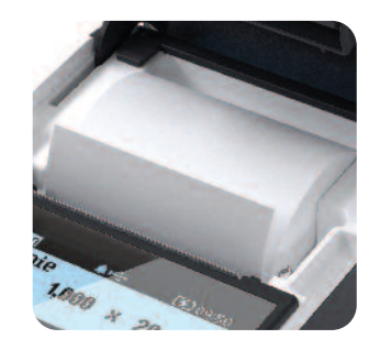
Easy replacement of pa