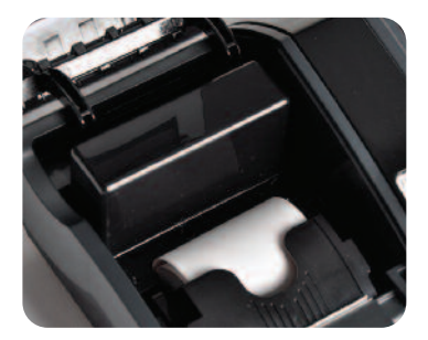
"Easy load" printing mechanism — easy replacement of paper