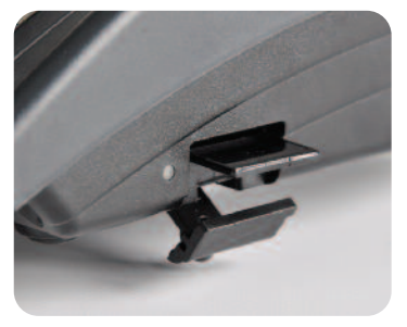
Electronic journal – convenience and savings