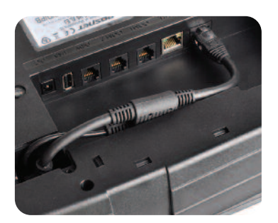
Functional communication ports, including Ethernet and USB